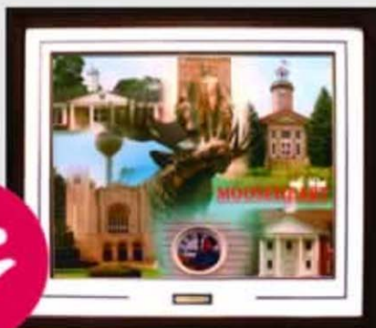
Photo collages of Mooseheart (left) & Moosehaven (below) are sent to Lodges/ Chapters when 10% of their combined membership begin participating in giving to Gimme 5.