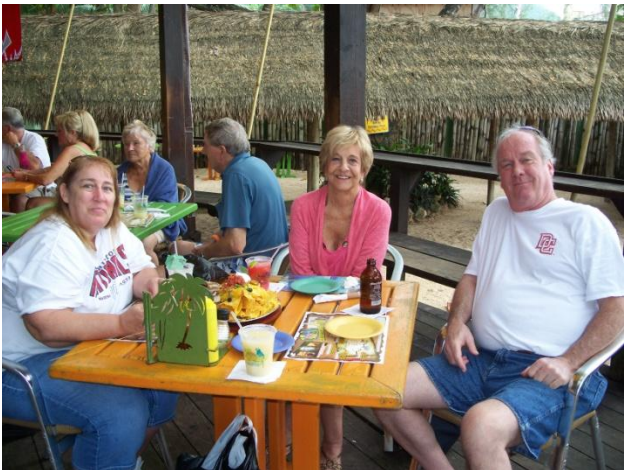
A few pictures from the Moose Cruise