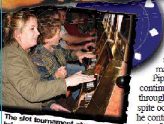
The slot tournament always brings an enthusiastic crowd to try to win prize money.